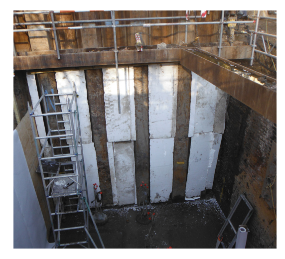
The deep, piled walls of the area to be waterproofed.

The completely waterproof structure is compliant with BS 8102:2009, providing a durable waterproofing solution in this large new basement situated directly next to the River Thames. After utilising multiple Newton Systems to great effect, MacLennanUK also provided an insured-backed guarantee for the work undertaken, confident in the level of protection against water ingress.