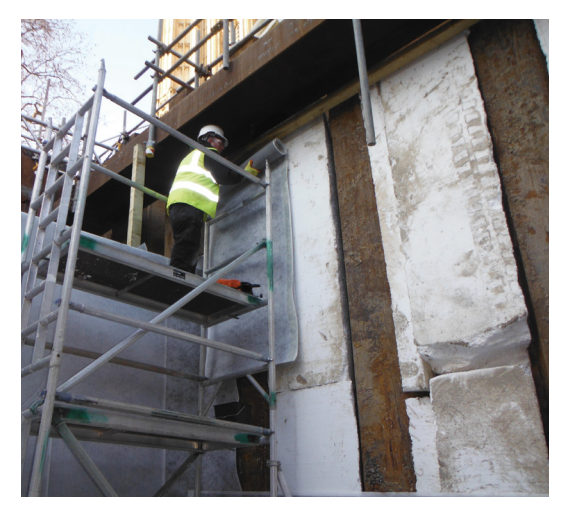
Applying 403 HydroBond directly to the piles.