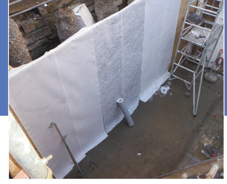
Newton 403 HydroBond is quick to apply in long sheets of membrane.