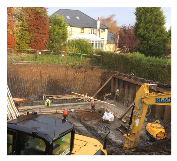
Extensive excavations were made for the new build.

The importance of the waterproofing at this luxury property is emphasised by the numerous systems that were installed, giving the client comprehensive protection that is also BS 8102:2009 compliant.