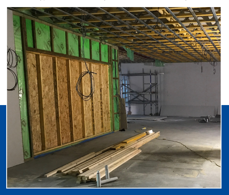
Internal finishes were safely installed in front of the CDM System.