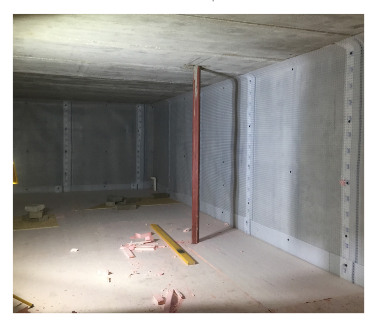
Type C Newton CDM System was installed internally.