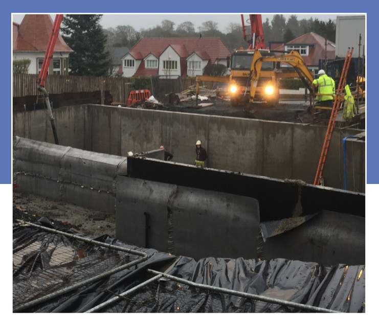
Newton 109-LM and 410 GeoDrain protect the external walls.