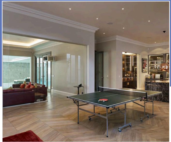
The largest basement area also has a living room and games room.

A comprehensive portfolio of liquid applied membranes for all substrates and all applications, ranging from very flexible liquid rubber products through to hard wearing and resilient cementitious membranes.