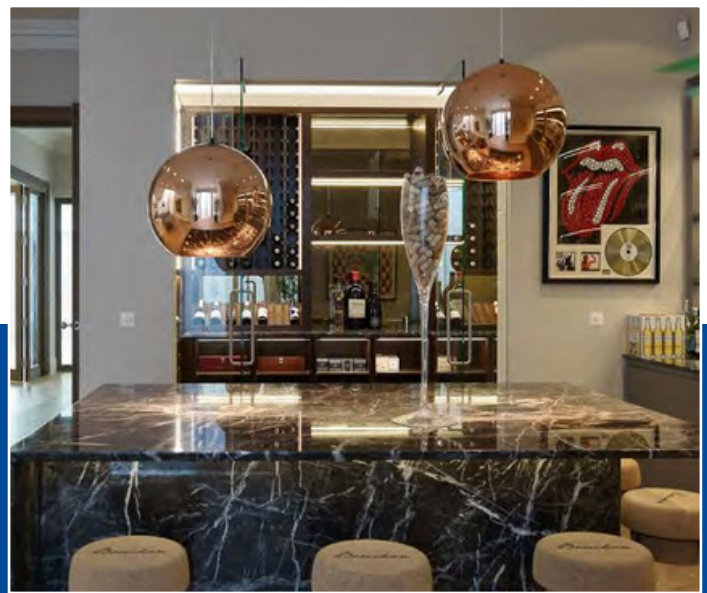
The luxury basement was finished to an extremely high standard.