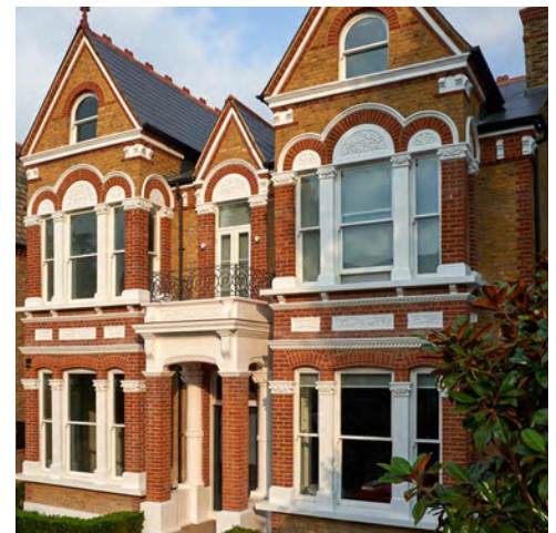
The front of the beautiful residential property.

Stonehouse are one of Newton's oldest and most experienced specialist contractors, and they showed their expertise here by delivering a dry, safe basement for the client that could then be transformed into a beautiful new part of their home. Furthermore, the installation was backed by Stonehouse's 10-year guarantee, for complete peace of mind.