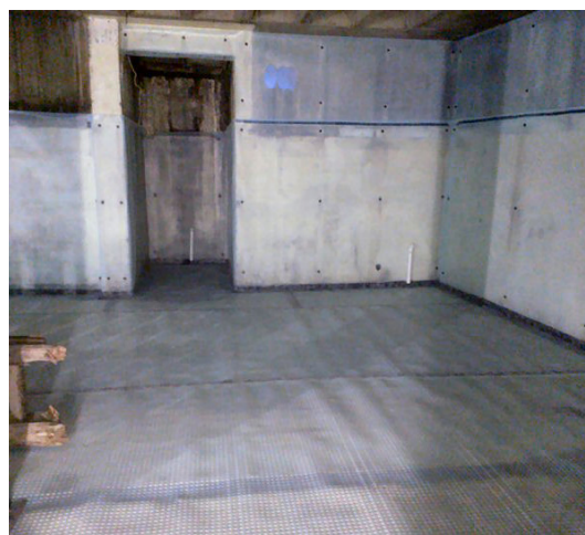
Newton 508 was applied to all internal walls and floors.

The Type C installation also conformed with BS 8102:2009, and Protectahome issued a long-term guarantee for the work.