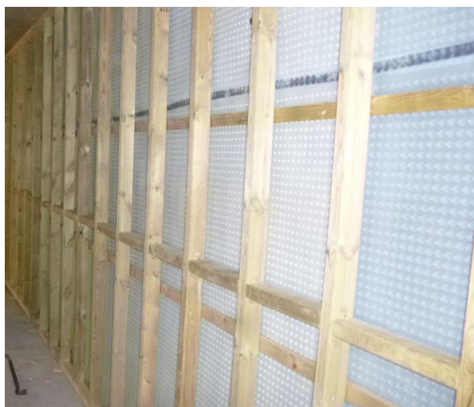
A timber frame was fixed to Newton MultiPlugs on the wall.