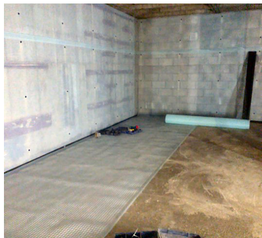
Newton MultiPlugs and Waterseal Tape were used.