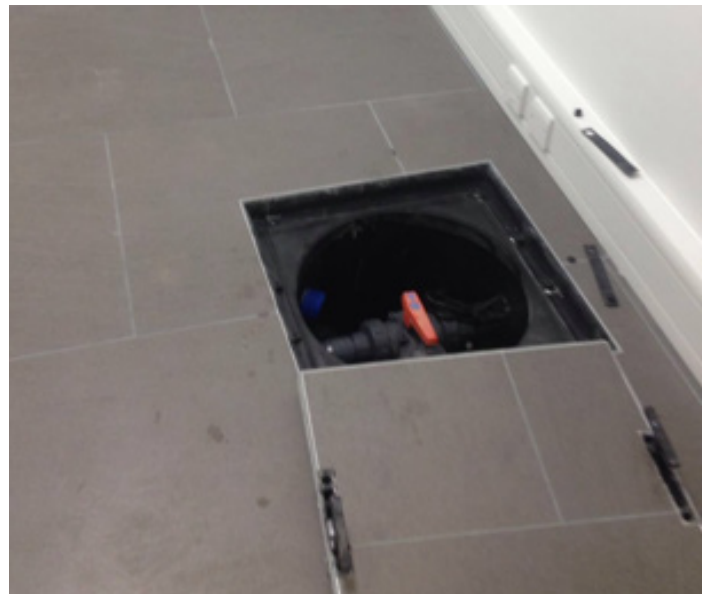
Four Titan-2 sump chambers pumps provided plenty of drainage.