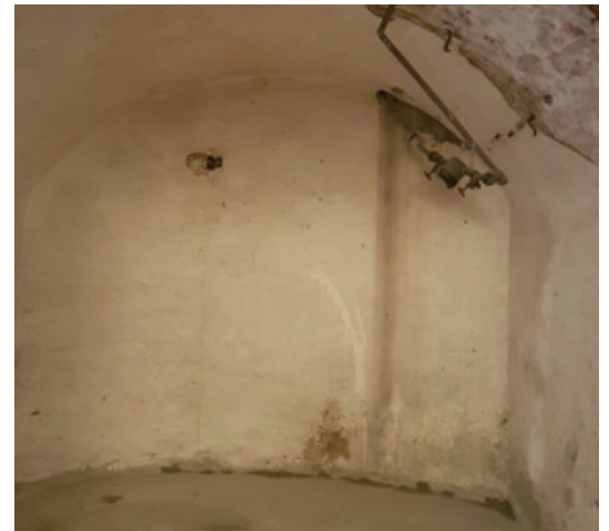
The original render was allowing in multiple leaks.

Now fully protected by a maintainable system, compliant with waterproofing code of practice BS 8102:2009, all 11 vaults are now completely dry, providing safe and healthy individual study rooms for the medical students at Imperial College.