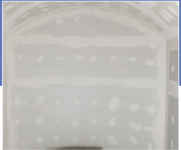
Timber battens were fixed into the heads of the MultiPlugs.

Designed to detect high water levels within Newton sump chambers, giving both visual and audible indication of the alarm condition.