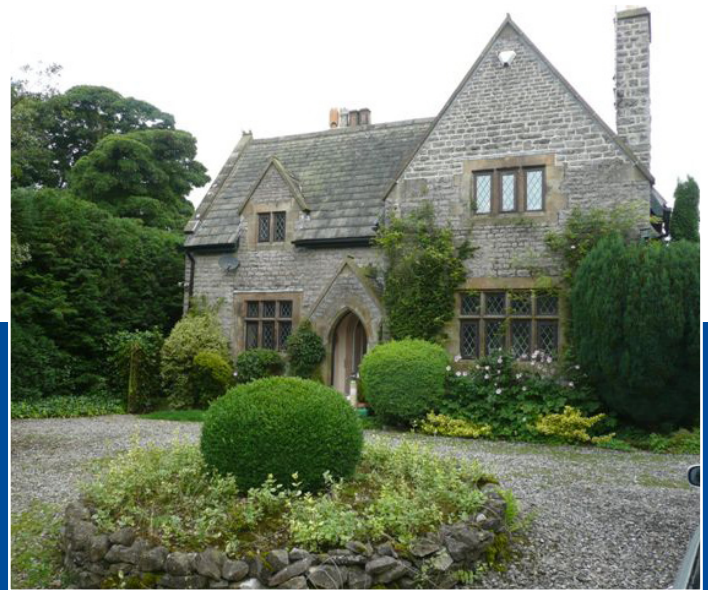
The basement of this countryside home is now fully protected.