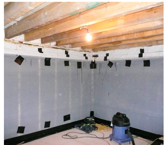
Installation of Newton PAC-500 System.

The results from the PAC-500 System were remarkable - Radon levels decreased from 5000bqm to less than 100bqm! The clients were left with a habitable and dry basement space.