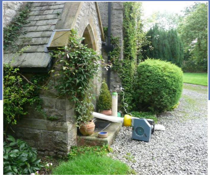
The testing revealed remarkable results.

A high performance pump available in either manual or automatic versions to remove clean water from the Newton CDM System.