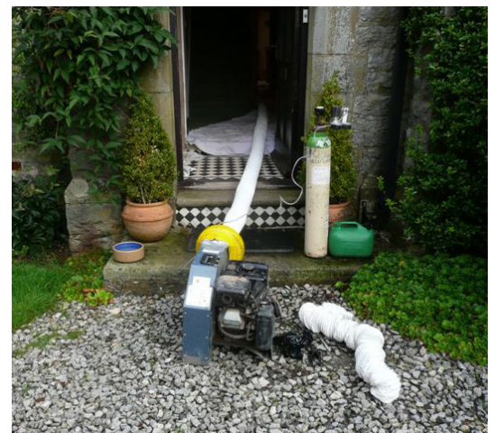
The PAC-500 System was tested in full.