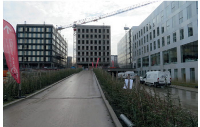
The project site

PC® 509 Rubber Acryl - acrylic injection resin