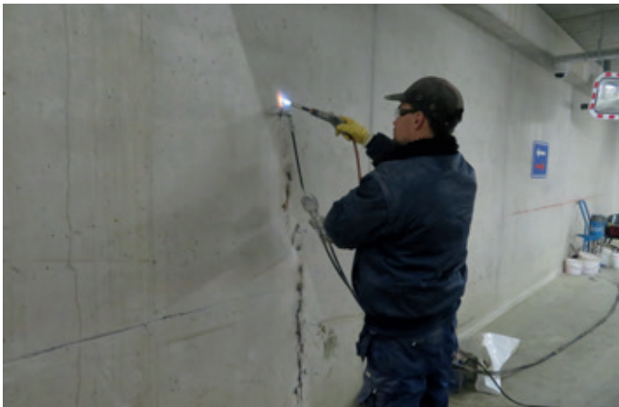
Sealing of the injection holes with a torch