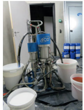
Two-component injection pump

This was done using the PC® 509 Rubber Acryl , a tough and elastic five-component injection resin.