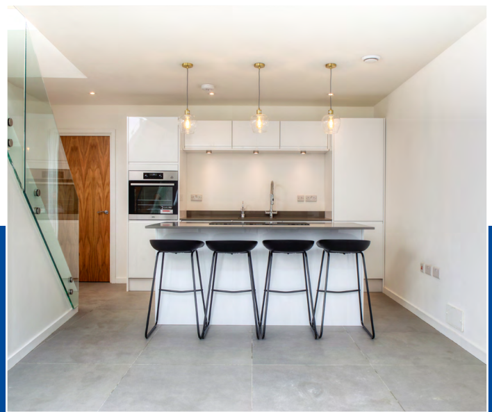
The basement waterproofing is insurance-backed for peace of mind