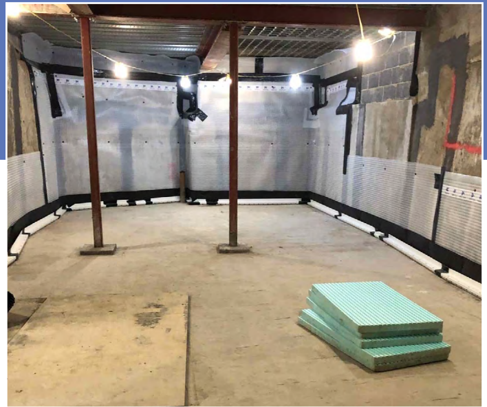
The CDM System was installed throughout all 21 basements

The Newton HydroTank System ensures that the structure is the primary resistance to water ingress, in this case by utilising the BDA Agrément certified HydroTank 315 Waterbar that swells in contact with water to seal the construction joints.