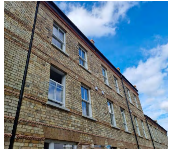
Edgeley revamped the whole community of houses

Edgeley have brought a whole community of houses into the 21st Century, simultaneously preserving their heritage and upgrading their performance to modern standards. Furthermore, by considering all risk factors, all 21 dry basements have also been delivered, with Newton sourcing an Insurance Backed Guarantee for Edgeley to pass further protection on to the client.