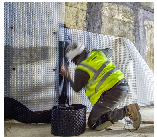
Cavity drain waterproofing is a reliable system