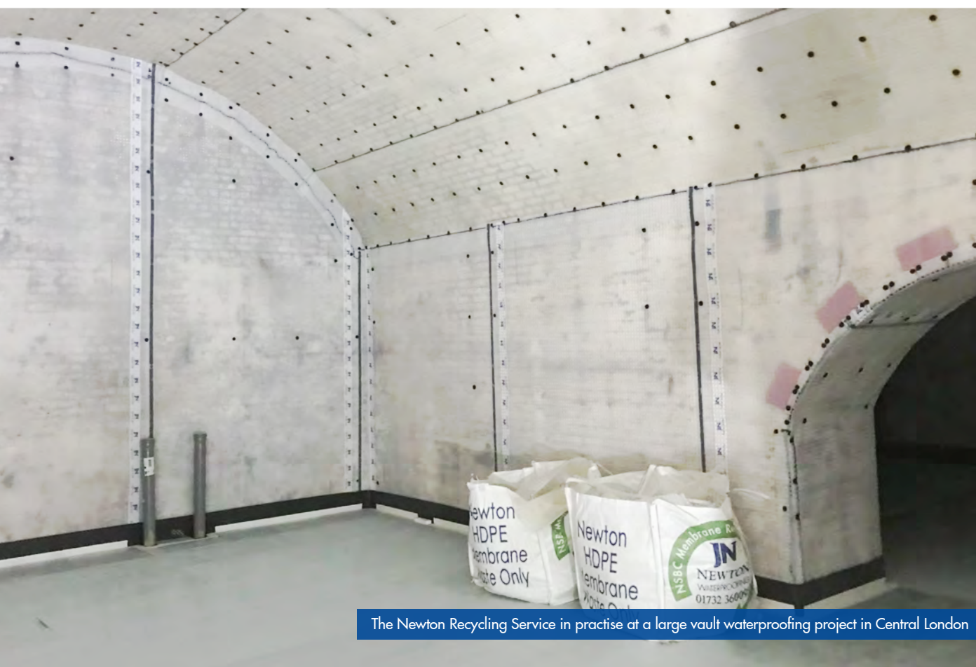
The Newton Recycling Service in practise at a large vault waterproofing project in Central London

WHICH WOULD BE ENOUGH ENERGY TO MAKE 416,453 MUGS OF TEA