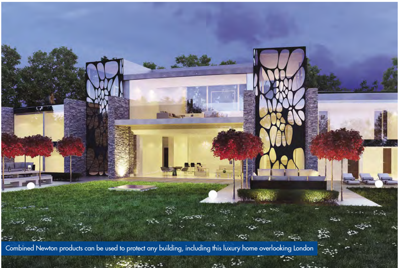
Combined Newton products can be used to protect any building, including this luxury home overlooking London

To find out more, read on, or call us on 01732 360 095.