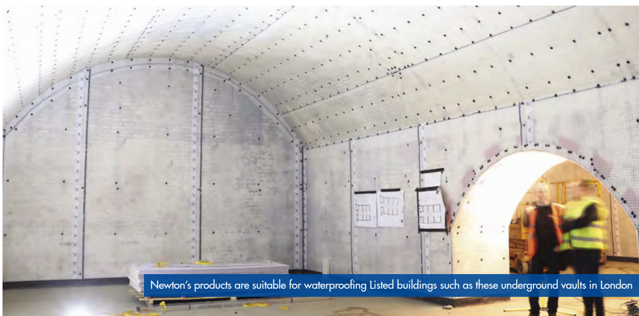
Newton's products are suitable for waterproofing Listed buildings such as these underground vaults in London

Cover is currently limited to installations in the UK only (including Northern Ireland).