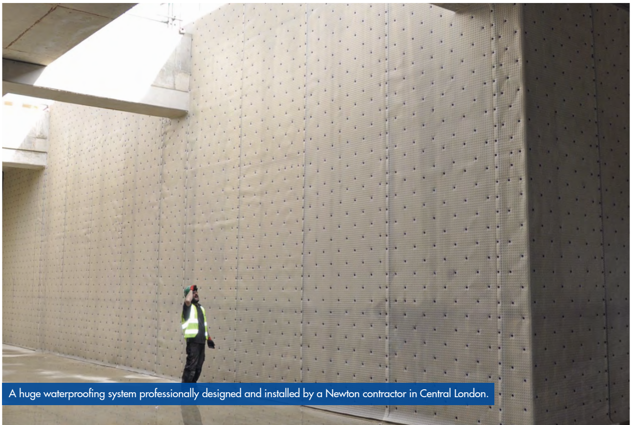
A huge waterproofing system professionally designed and installed by a Newton contractor in Central London.

We are proud to be able to provide this this level of protection to our contractors and customers.