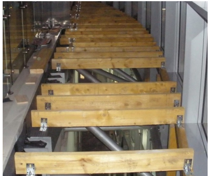
A new internal timber floor, wall and deck structure was required.