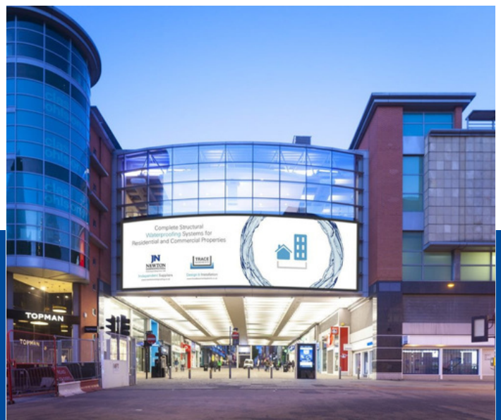
A new internal timber floor, wall and deck structure was required.