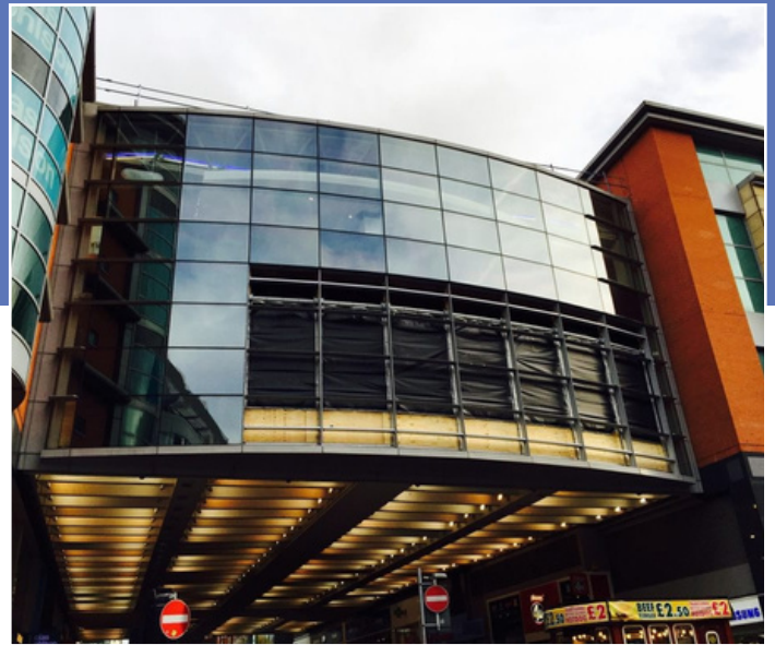
The digital screen was recessed into the building and fully weatherproofed.

Newton Floorgum Paint is a single component liquid coating formulated with water- based resins.