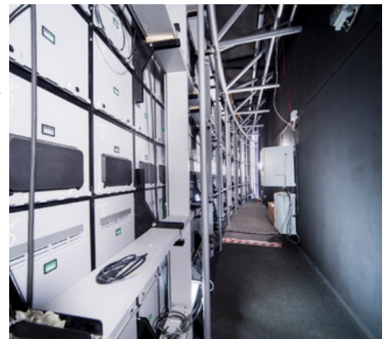
Newton Acriflex Winter and Newton Floorgum Paint were applied.

The requirements upon the waterproofing materials were exacting, including the satisfaction of criteria for the surface spread of flame. All were met by the Newton Waterproofing products employed, with liquid waterproofing membrane Newton Acriflex Winter, and protective waterproof coating Newton Floorgum Paint both expertly installed by Trace Basements.